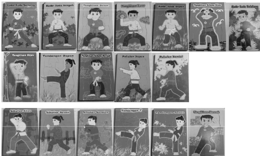
Picture. Puzzle display and coloring book After Final Revision